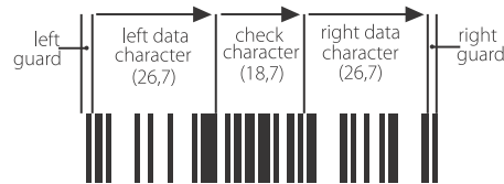
Figure 15 - GS1DataBar Limited Bar Code Structure

The left and right Guard Bar Patterns consist of a narrow space and narrow bar. The GS1 DataBar Limited Bar Code does not require Quiet Zones.