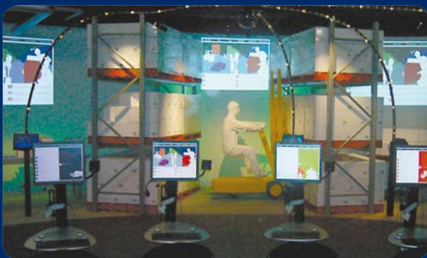
Above: The GS1 Supply Chain Knowledge Centre