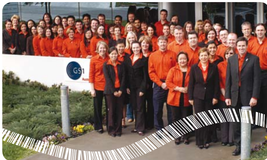
Above: GS1 Australia staff