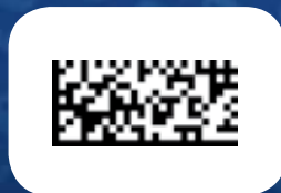
GS1 Data Matrix